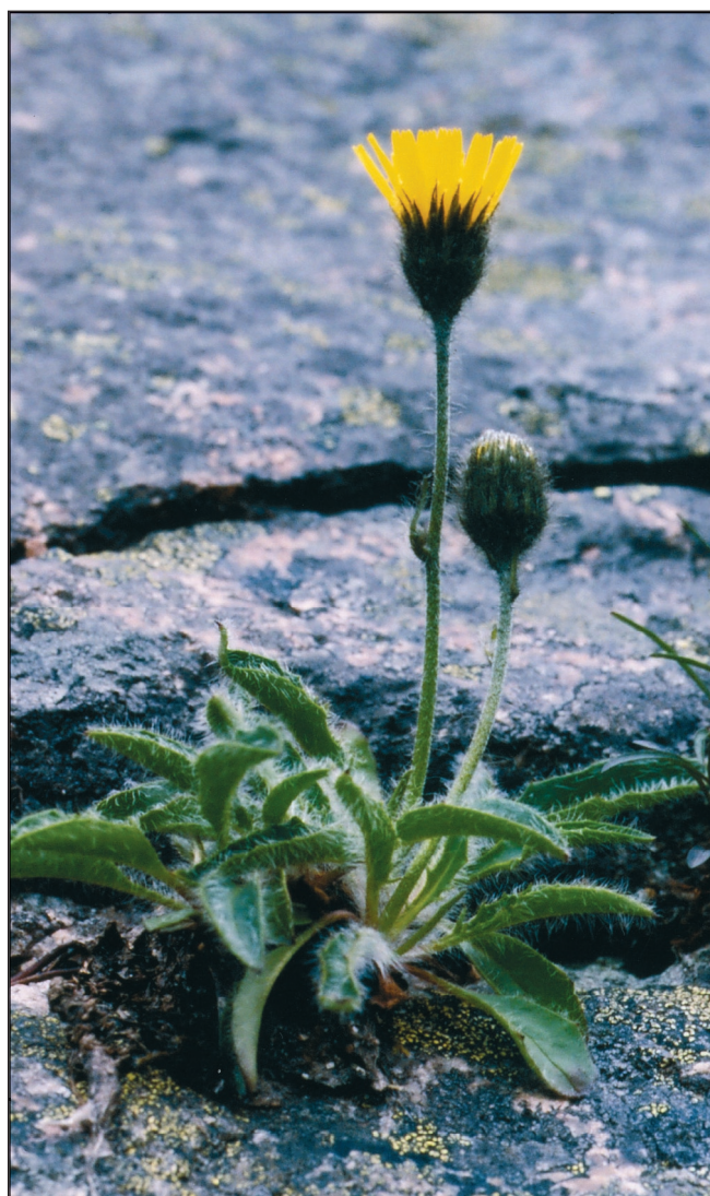
Figure 100. Hieracium larigense , Lairig Ghru, 1986.

Hieracium larigense is characterised by the very numerous, long, often greyish simple eglandular hairs on the uppermost part of its stem, by its rosette leaves which are usually glossy