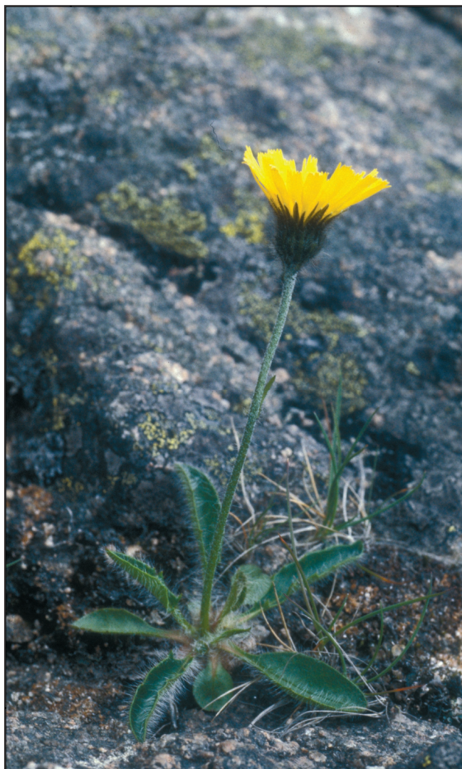
Figure 101. Hieracium larigense , Creag an Leth-choin, 1986.